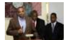
Steele-Collins Charter School